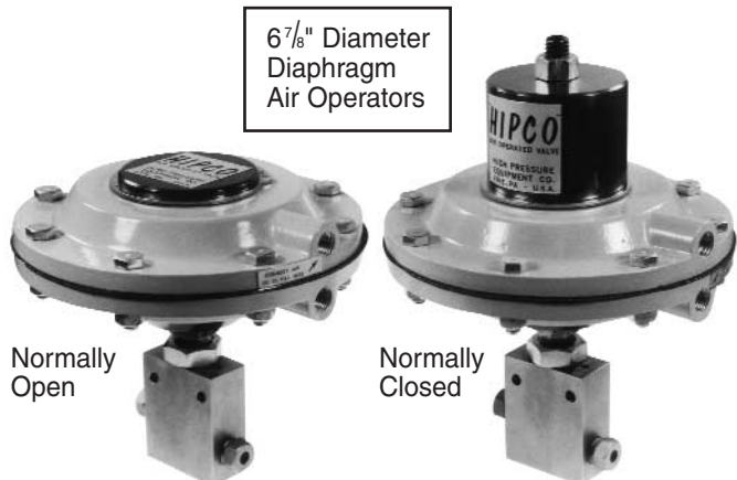
6 7/8" Diameter Diaphragm Air Operators

Considerations . . . Extended stuffing box for temperatures from -423°F to 1,200°F (medium and high pressure connections only)